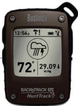
Barometer, Temperature & Weather Trend

Press the TRIP/DATA button briefly to view and cycle through the Hunting Data screens