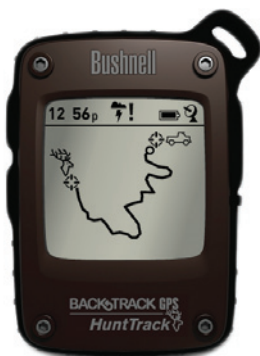
Previous Route Between Locations