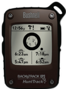
Sunrise / Sunset & Moon Phase Data