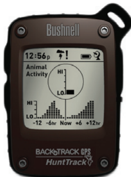
Animal Activity Meter & Predictive Graph

Press the TRIP/DATA button briefly to view and cycle through the Hunting Data screens